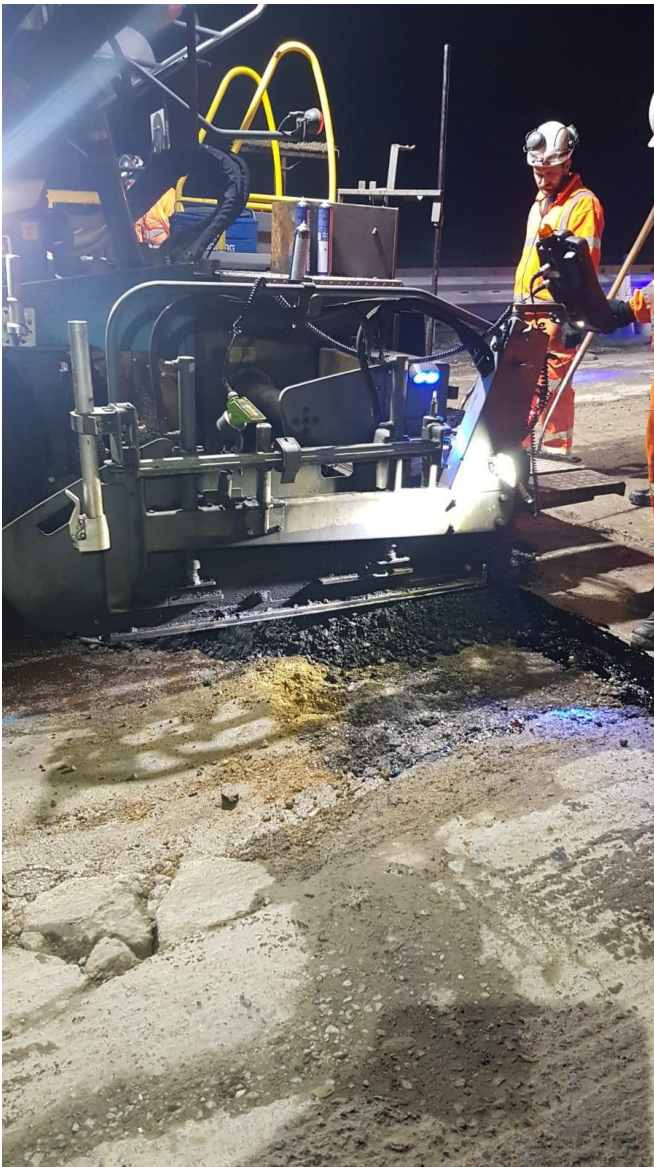
Above: Working at night means we can continue our progress towards reconstructing this stretch of the A14 road

The carriageway is still reduced to one lane in both directions as we work, and the speed limit remains at 50mph to ensure the safety of our workers and other road users.