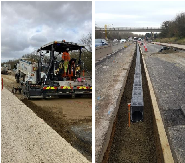
Above: New base foundation layer and slot drain on the westbound carriageway

These signs currently display the percentage of construction activities completed on the scheme to date. The percentage currently displayed is due to be updated at the beginning of April.