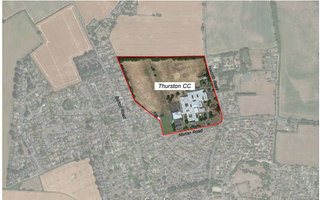
Above: Location Plan

If possible please comment online at www.suffolk.gov.uk/consultations or via email to schools@suffolk.gov.uk . Completed paper comment forms must be returned to TCC Consultation, Schools Infrastructure Team, Suffolk County Council, Endeavour House, 8 Russell Road, Ipswich IP1 2BX. All comments must be received by Friday 16th July 2021 .