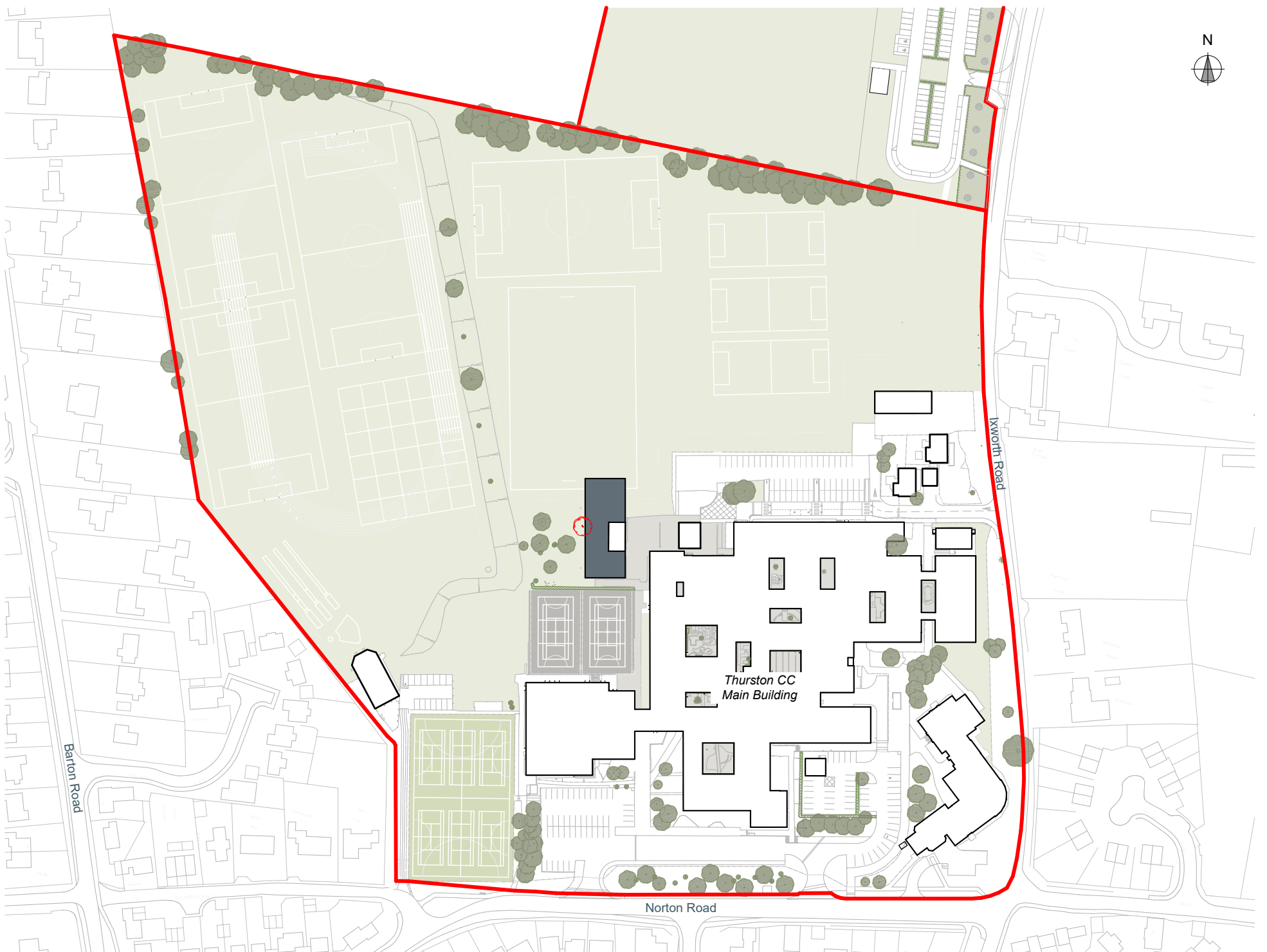
Above: Concept Site Masterplan