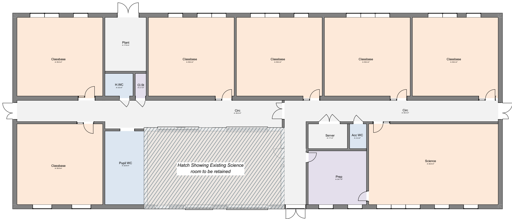
Above: Proposed Ground Floor Plan