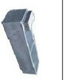
HH DET. 09.08 - R20 Timber Morticed Post and Rail Fence 1/20 @ A3

Galvanised Steel Allotment Water Dip Tank with Service Box and Float Valve. Manufactured from 1.6mm (16) gauge steel with roll top edges. Dimension 1800mm x 610mm x 610mm excluding service box. Capacity approx. 681 ltr (150 gallons)