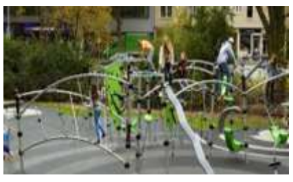
Example of a MUGA