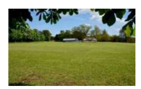
The Recreation Field

Proposals for built development on these Local Green Spaces must be consistent with policy for Green Belts and will not be permitted unless it can be clearly demonstrated that it is required to enhance the role and function of that Local Green Space.