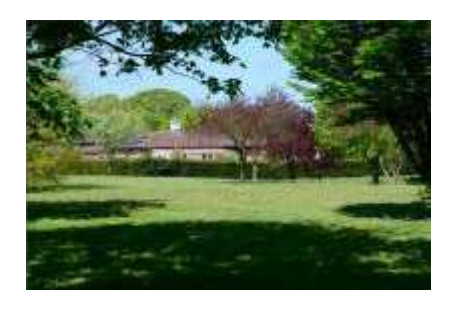
New Green open space

To ensure adequate provision of community, retail, education, leisure facilities, telephony, sewage, and services such as doctors, dentist and family services to support the needs of existing and future population.