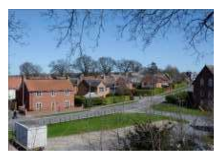
Recent Development, Station Hill