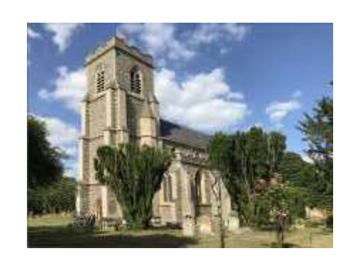
St Peter's Church